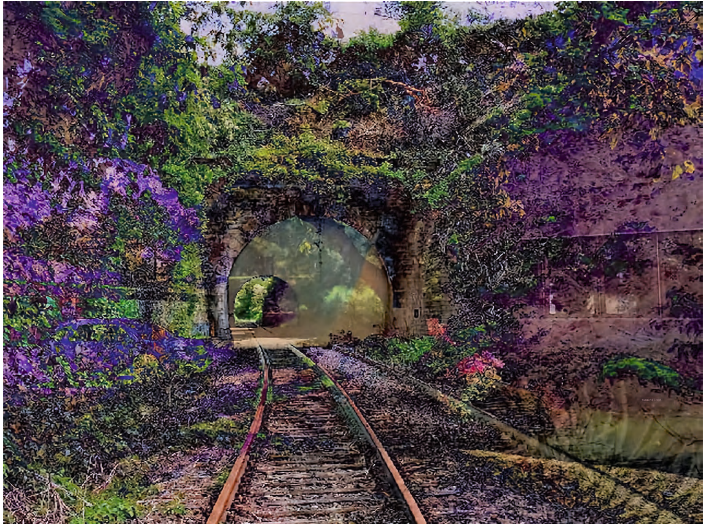
DABUS/Stephen Thaler A Recent Entrance to Paradise, 2012

What does it really mean to author, to own, or to replicate art? The data-hungry mash-up engines of AI are eroding the value precepts of scarcity and individual expression at the heart of copyright law. Is this the occasion to reconsider the limits of private property systems, if not the very make-up of creativity?